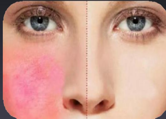
Redness & vascular treatment