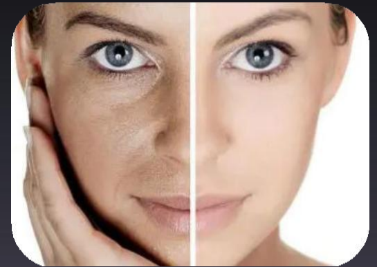
Skin tone brightening